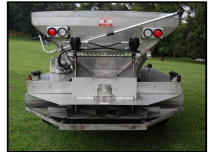
Stainless Steel Spinner Assembly