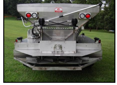
Stainless Steel Spinner Assembly