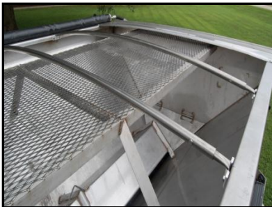
Stainless Steel Grate