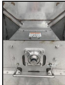
Auger Slide Gate