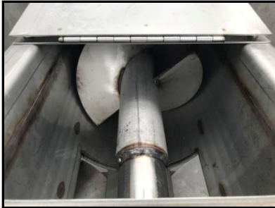
12" 304 SS Auger

All Products and Specifications subject to change without notice.