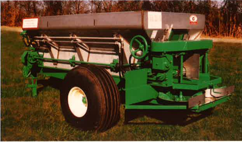
(Unit Shown W/PTO Drive Spinners)