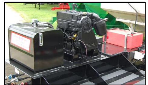
Self Contained Hydraulic System