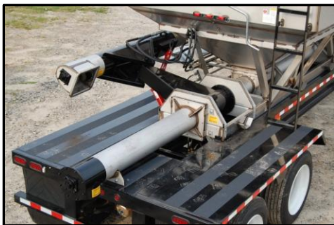
Pit Pump Assembly