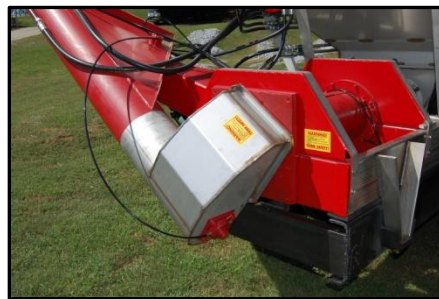
Pivot Auger Assembly