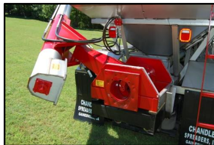
Pivot Auger Assembly