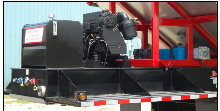
Self Contained Hydraulic System