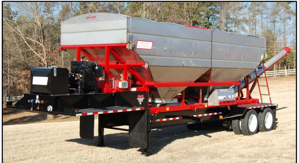
Optional Equipment: Agri-Cover SRT 2 Roll Tarp Assembly