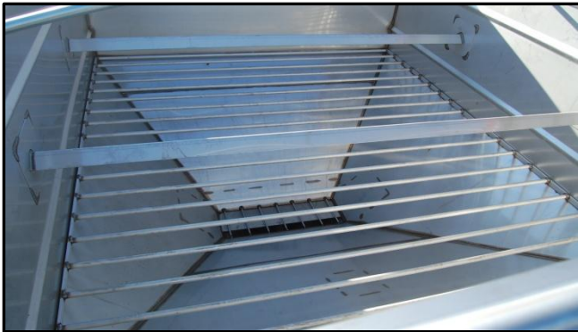
304 Stainless Steel Grate inside Hopper