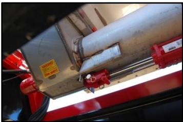
Hydraulic Clean Doors