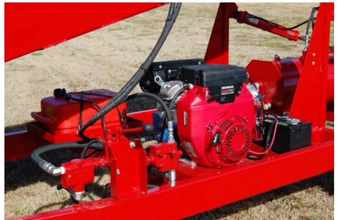
Self-Contained Hydraulic System