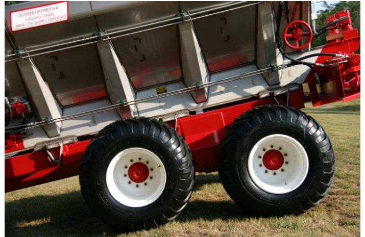
Tandem Axle Walking Beam Suspension