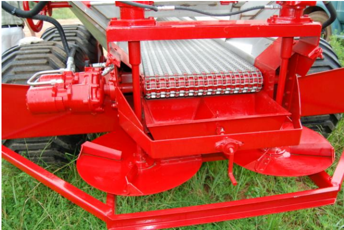
Spread Patterns: Fertilizer up to 70' Lime up to 50'