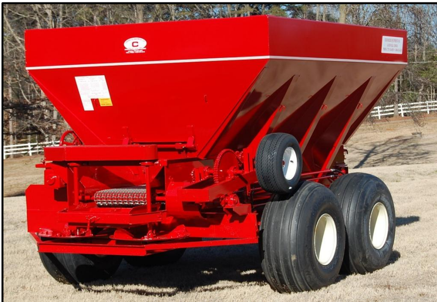
(Shown in Mild Steel – 45 Degree Slope Sides)