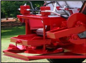
Hydraulic Spinners (Optional)