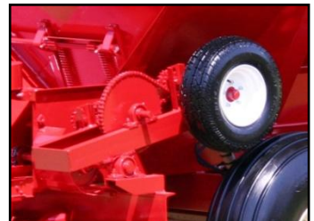
Press Wheel Drive Assembly with Cylinder Engagement