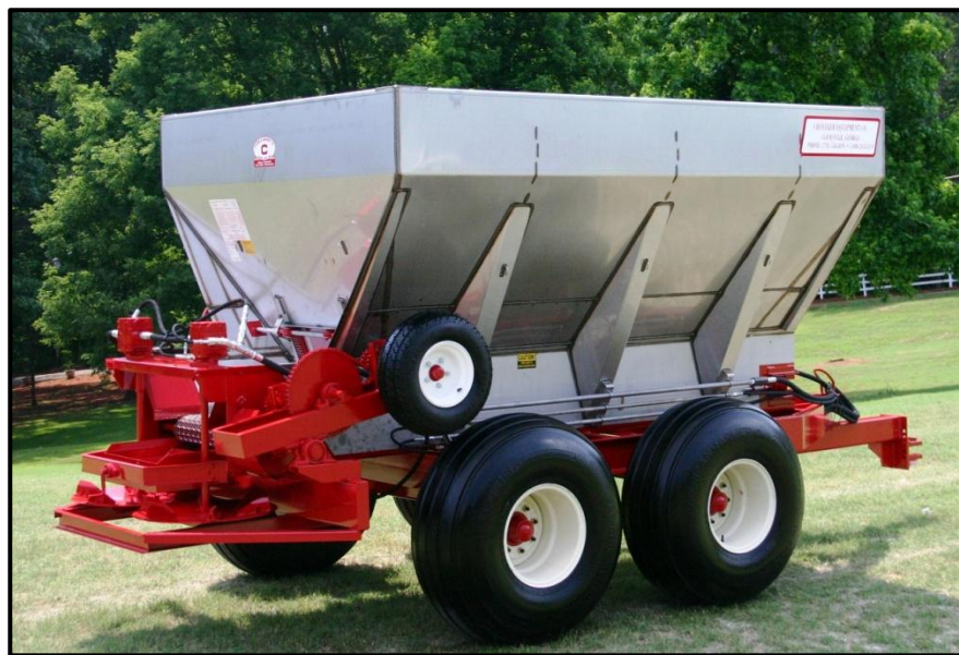
(Shown with 304 Stainless Hopper 52 Degree Slope Sides)