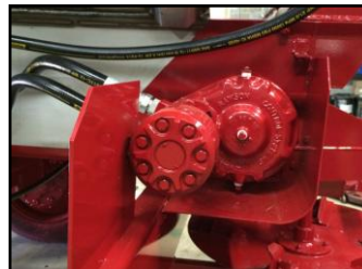
Hydraulic Drive Assembly (Optional)