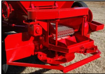
540 – RPM PTO Drive Spinners (Standard)